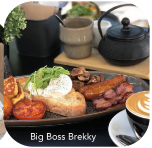
Big Boss Brekky