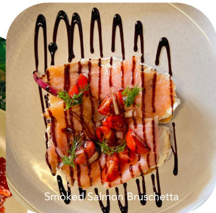
Smoked Salmon Bruschetta