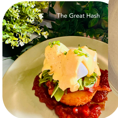
The Great Hash

Cream Cheese spread on toasted artisan sourdough topped with smoked salmon and cherry tomato and onion vinaigrette and balsamic glaze.